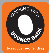
bb_ww_desktop.jpg For all desktop printing