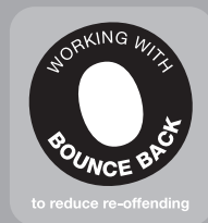
bb_ww_mono.jpg For all black and white print.