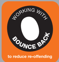
bb_ww_onscreen.jpg For use on screen.

There are a number of 'Icons' available. Please get in touch or download the correct file from the Bounce Back website, these are all available at www.bouncebackproject.com . A small selection of stickers are also available if required, please call (0)20 7735 1256 for details.