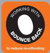
bb_ww_onscreen.jpg For use on screen.

There are a number of 'Icons' available. Please get in touch or download the correct file from the Bounce Back website, these are all available at www.bouncebackproject.com . A small selection of stickers are also available if required, please call (0)20 7735 1256 for details.