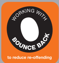
bb_ww_proprint.eps For all progressional print. Both large and small scale